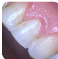
Figure 8. After

seconds (Figure 8). The material was allowed to completely polymerize before finishing and polishing was performed.