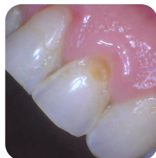
Figure 7. Before

In this clinical scenario, the patient presented with cervical erosion and sensitivity on tooth #26 (Figure 7). The patient has a moderate to high caries risk, and due to the properties of the GC Fuji Automix LC , it was selected as the material of choice in treating this case. The GC Cavity Conditioner was applied for 10 seconds and then rinsed, leaving the tooth surface moist. The GC Fuji Automix LC was placed onto the tooth, sculpted, and light cured for 20