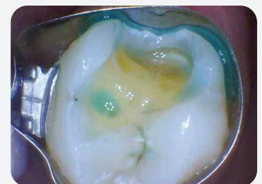
Figure 4. GC Cavity Conditioner applied for 10 seconds, light cured for 20 seconds and subsequently rinsed.