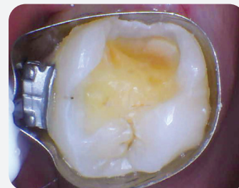
Figure 3. Prepared tooth 15 with Medicom SafeMatrix Contoured matrix band. (Note: the discoloration in the occlusal groove was determined to be staining)