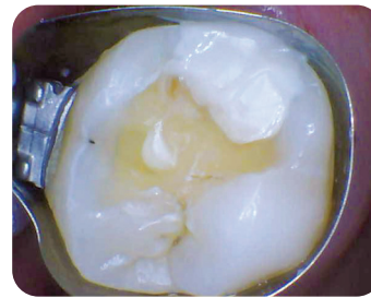
Figure 5. GC Fuji Automix LC after curing.

The patient followed up for subsequent restorative therapy three weeks later and reported no sensitivity or symptoms.