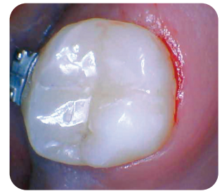
Figure 6. Final restoration following occlusal adjustment, contouring, and polishing.