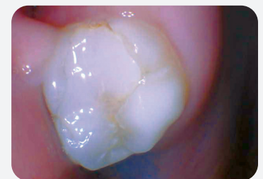
Figure 2. Pre operative intraoral photo of tooth 15 showing an existing resin restoration with recurrent decay on the distal, occlusal, and lingual surfaces.