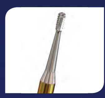
Alpen® Speedster® Coltene Whaledent, Inc.