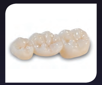
BruxZir® Full-Strength Zirconia Glidewell Dental Laboratories