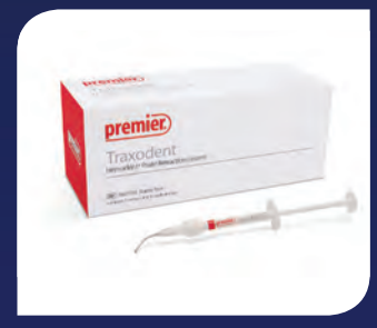
Traxodent ® Premier Dental Products Co.