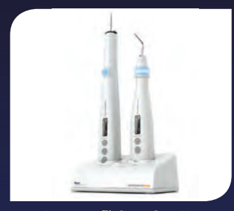
elements™ free Cordless Continuous Wave Obturation Kerr Endodontics