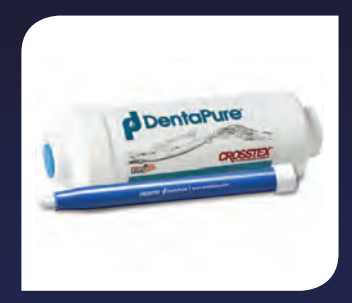
DentaPure DP365B Crosstex International