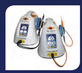
Picasso /Picasso Lite AMD LASERS®