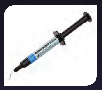
CLEARFIL MAJESTY™ ES Flow Kuraray America, Inc.