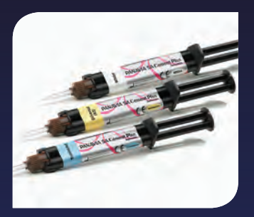
PANAVIA™ SA Cement Plus Kuraray America, Inc.