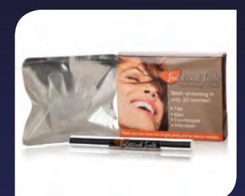
Sinsational Smile Sinsational Smile, Inc.