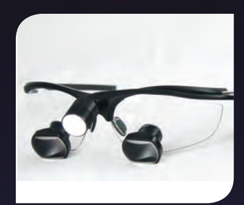
Feather Light LED UltraLight Optics, Inc.