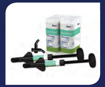
Harmonize™ Universal Composite Kerr Restoratives