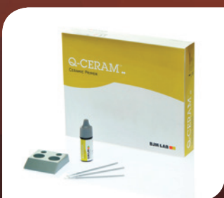
Q-CERAM B.J.M. Laboratories, Ltd.