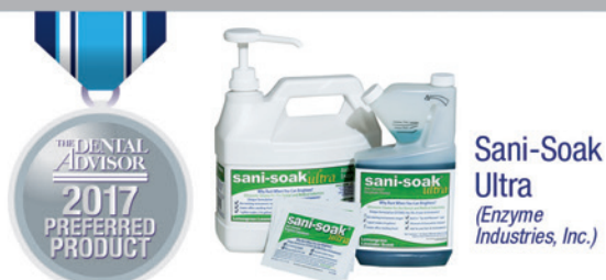
Sani-Soak Ultra (Enzyme Industries, Inc.)