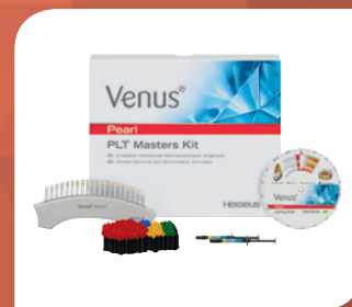
Venus® Pearl Heraeus Kulzer