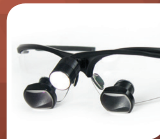
Feather Light LED Ultralight Optics, Inc.