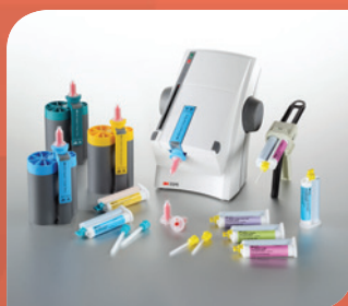
Imprint 4 VPS 3M