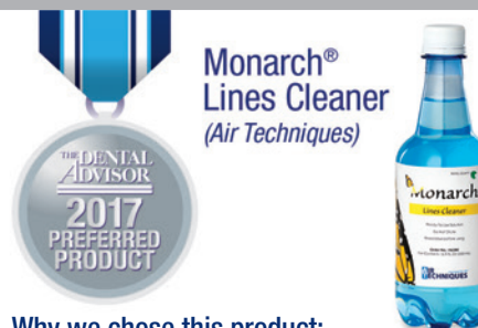
Monarch® Lines Cleaner (Air Techniques)