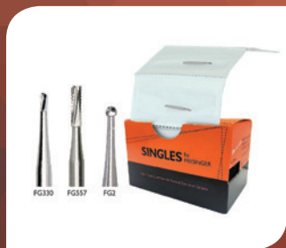
SINGLES (Carbides) Meisinger USA, LLC