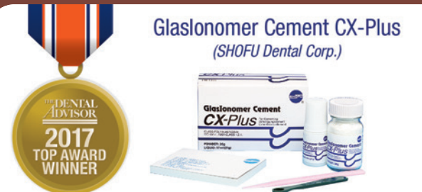
Glaslonomer Cement CX-Plus (SHOFU Dental Corp.)