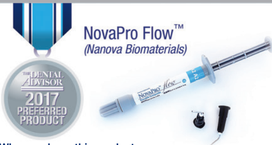
NovaPro Flow™ (Nanovs Biomaterials)