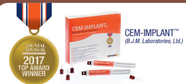
CEM-IMPLANT™ (B.J.M. Laboratories, Ltd.)