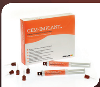
CEM-IMPLANT™ B.J.M. Laboratories, Ltd.