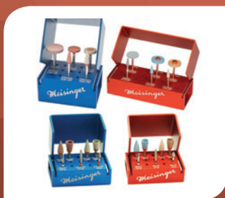
Luster for Zirconia and Lithium Disilicate Meisinger USA, LLC