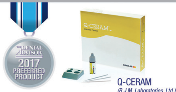
Q-CERAM (B.J.M. Laboratories, Ltd.)