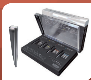
GLASSIX Plus Radiopaque & Light Transmitting Fiber Post Nordin Dental