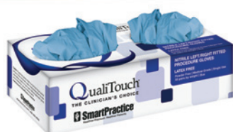
QualiTouch Blue Nitrile Left/Right Fitted Gloves (Smart Practice)