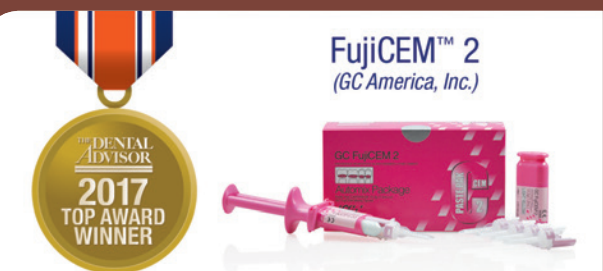
FujiCEM™ 2 (GC America, Inc.)