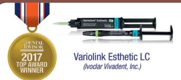
Variolink Esthetic LC (Ivoclar Vivadent, Inc.)