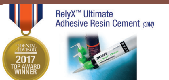
RelyX™ Ultimate Adhesive Resin Cement (3M)