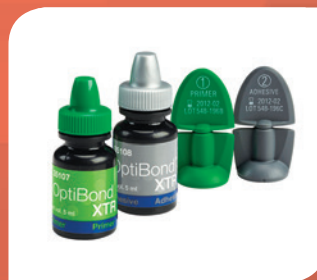
OptiBond® XTR Kerr Restorative