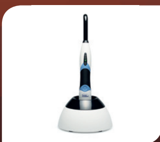
Bluephase Style Ivoclar Vivadent, Inc.