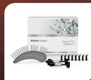
Admira Fusion VOCO