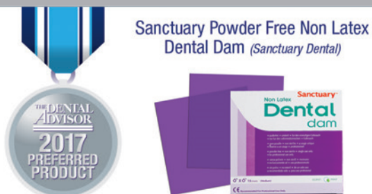
Sanctuary Powder Free Non Latex Dental Dam (Sanctuary Dental)