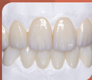
BruxZir Anterior Solid Zirconia