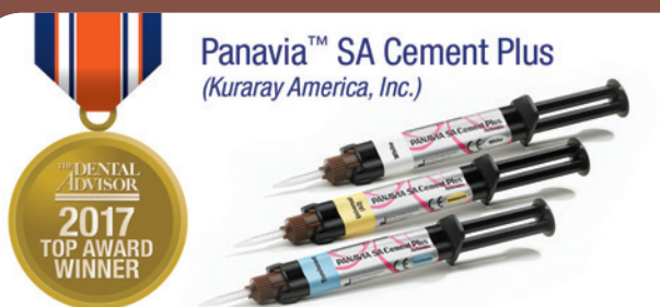
Panavia™ SA Cement Plus (Kuraray America, Inc.)