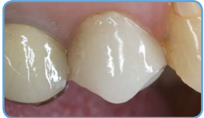
Fig 6 Final Restoration