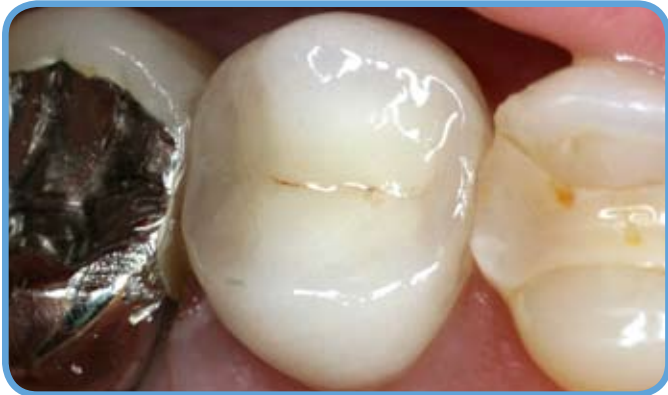
Fig 5 Final Restoration