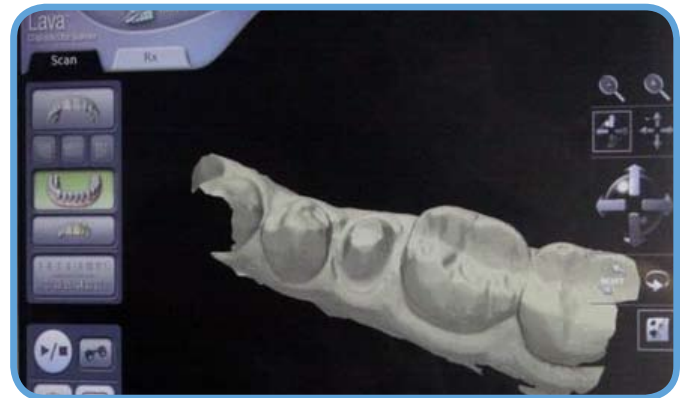
Fig 2 Display