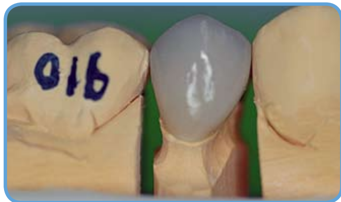
Fig 4 Traditional Model

Each crown was carefully checked on its respective die, then on the opposite die, and on the actual tooth. The crowns were evaluated for fit, stability, esthetics, occlusion, and the quality of the mesial, distal, lingual, and facial margins. The crown with the best fit and accuracy was cemented intraorally.