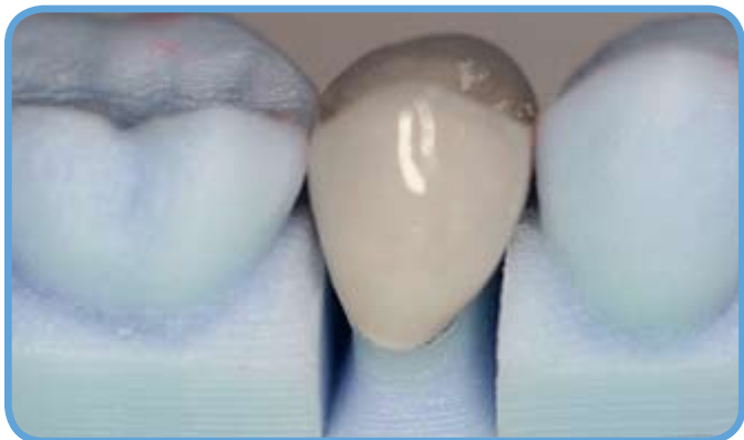
Fig 3 SLA Model

For purposes of comparison, two Lava zirconia crowns were fabricated: one derived from the digital impression and one derived from the traditional impression.